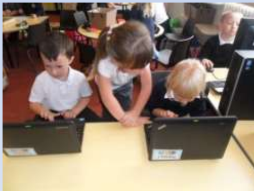
We enjoy exploring and working with software to help us learn the sounds.