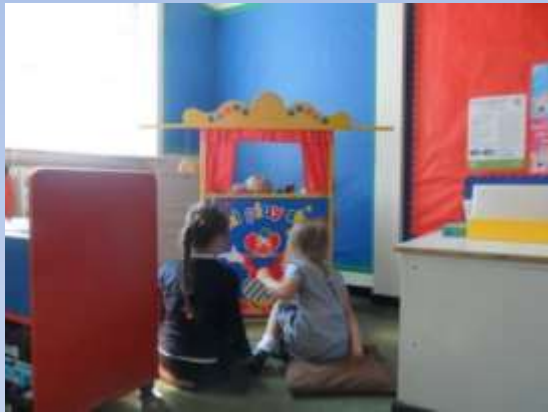
Creative talking and attentive listening.