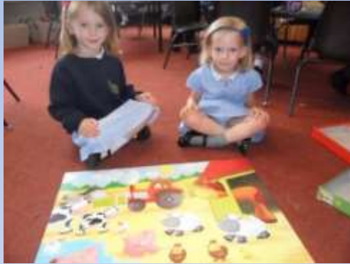
Working with a partner.