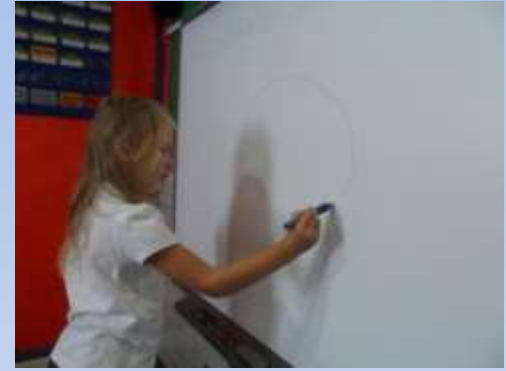
Exploring writing materials.