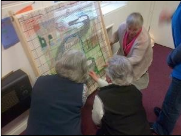
Members of the Chirnside Common Good Association added a stitch or two.