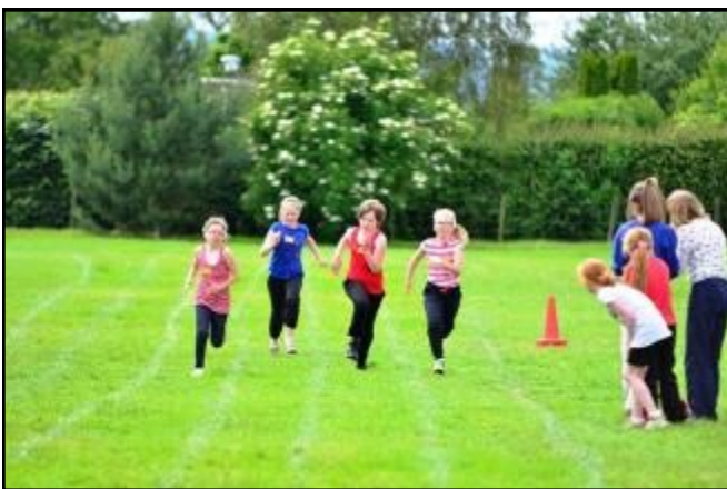
A heat of the P7 Girls' 200m