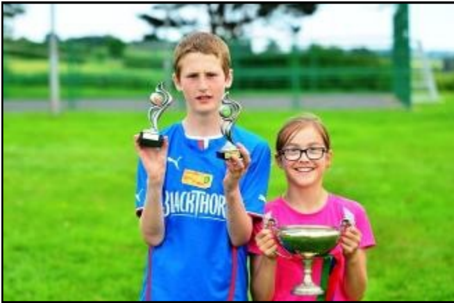
Blackadder House Captains received the trophy for Track and Field Champions.