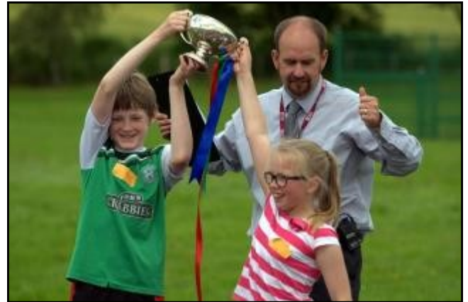
Whiteadder House Captains received the trophy for Potted Sports Champions.