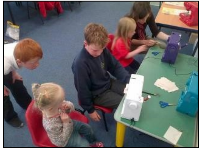
Nursery children, under the careful guidance of our Primary 5 pupils, get to grips with the sewing machines to stitch their panel.