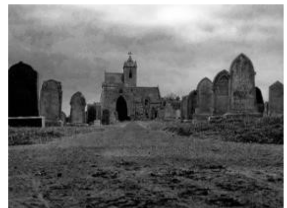
Joana Gasper's photo of Chirnside Church