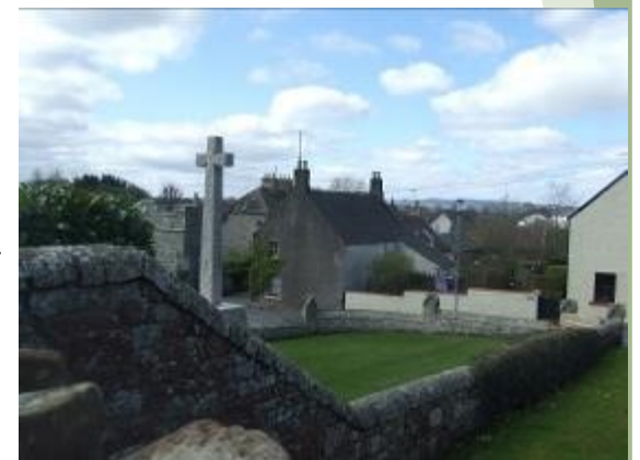
Rebecca Richards' photo of Chirnside Church Yard

All photos are currently on display in the school hall. Please call in to view at the end of the school day (3.20pm) before the end of term.