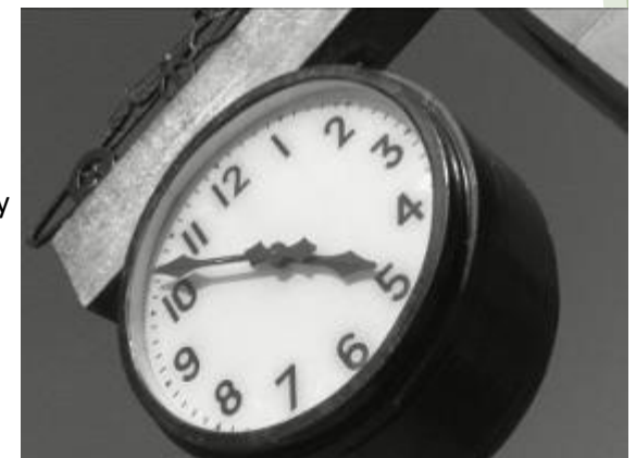
Omar Gibson's photo of Chirnside village clock